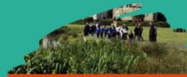
Green Health Partnerships Partnerships piloting ways to make the most of nature

03 Green Health Partnership - Under budget, additional workshops being planned prior to end March.