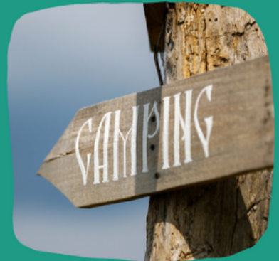
TGDC Net Zero Camping