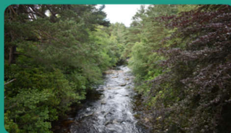
Glen Tannar Juniper Walk