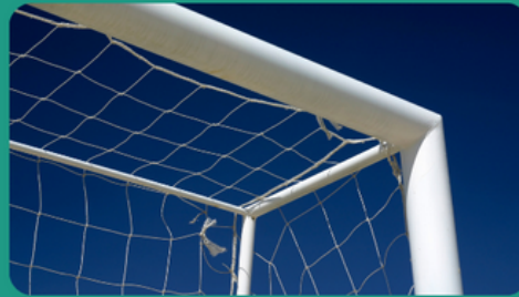
Kincraig Junior Shinty Club