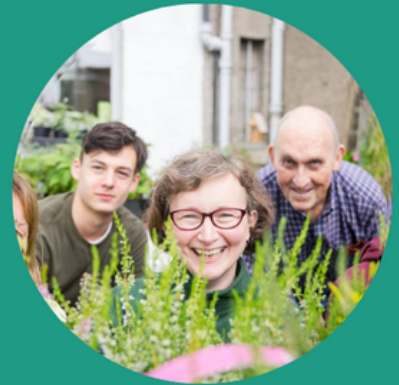
Grassroots Shop Talk series