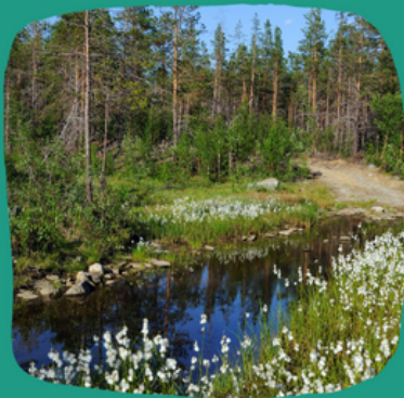
Scotland The Big Picture Lynamer Wetland